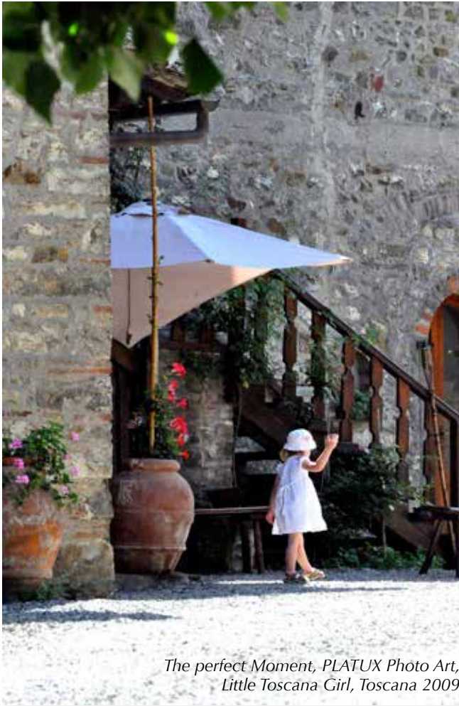
The perfect Moment, PLATUX Photo Art, Little Toscana Girl, Toscana 2009